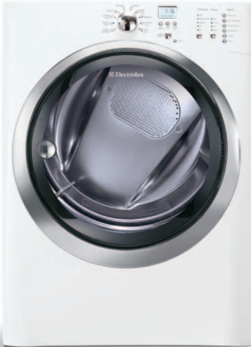
Island White EIGD55H IW